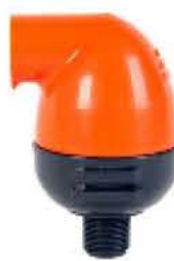
Item No.: SGV5004 Size: 1/2", 3/4", 1"