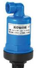
Item No.: SGV5009 Size: 1"