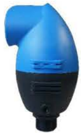
Item No.: SGV5005 Size: 1"