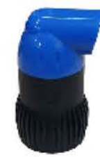
Vacuum Breaking Valve Item No.: SGV5015 Size: 2"