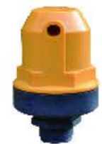
Item No.: SGV5007 Size: 1"