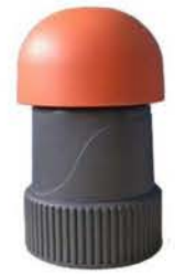
Item No.: SGV5013 Size: 2"