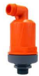
Item No.: SGV5010 Size: 1/2", 3/4", 1", 1.25", 1.5", 2"