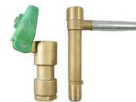
Material: Brass Item No.: SGV5105 Size: 3/4", 1" female Working Pressure: 15 bar