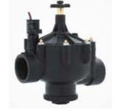
Item No.: SGV5303 Flow Controller & Manual Switch Size: 2", 3" DC12V, DC24V, 12V/50; 24V/50; 110V/50; 220V/230V/50 Pulse 6-24vdc Voltage Available