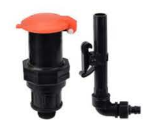
Item No.: SGV5104 Size: 3/4" male Working Pressure: 1-8 bar