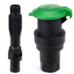
Item No.: SGV5102 Size: 3/4", 1" female Working Pressure: 1-8 bar