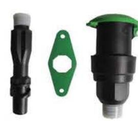
Item No.: SGV5101 Size: 3/4", 1" male Working Pressure: 1-8 bar