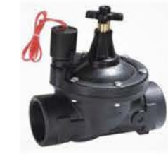
Item No.: SGV5303 Flow Controller & Manual Switch Size: 1.5", 2" DC12V, DC24V, 12V/50; 24V/50; 110V/50; 220V/230V/50 Pulse 6-24vdc Voltage Available