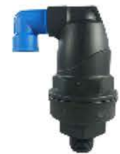
Item No.: SGV5011 Size: 1", 2"