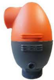
Item No.: SGV5006 Size: 2"