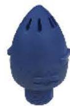
Item No.: SGV5008 Size: 3/4", 1"