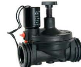
Item No.: SGV5302 Flow Controller & Manual Switch Size: 3/4", 1" DC12V, DC24V, 12V/50; 24V/50; 110V/50; 220V/230V/50 Pulse 6-24vdc Voltage Available