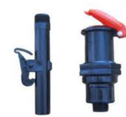
Item No.: SGV5103 Size: 3/4" male Working Pressure: 1-8 bar