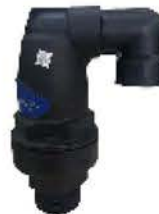
Combination Valve Item No.: SGV5012 Size: 2"