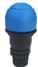
Item No.: SGV5014 Size: 3/4", 1"