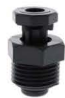
Item No.: SGV5001 Size: 1/2"