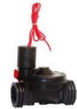
Item No.: SGV5301 Manual Switch Size: 3/4", 1" DC12V, DC24V, 12V/50; 24V/50; 110V/50; 220V/230V/50 Pulse 6-24vdc Voltage Available